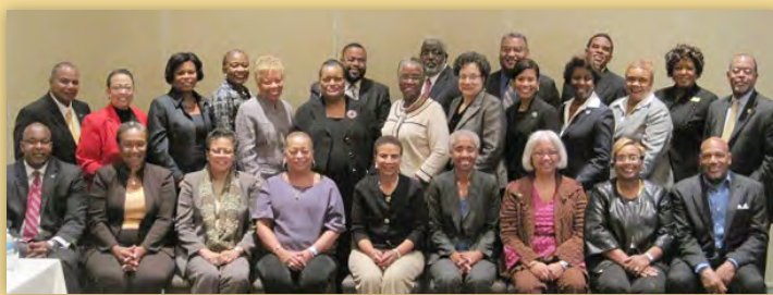
PRT members in attendance at the October 2011 business meeting.