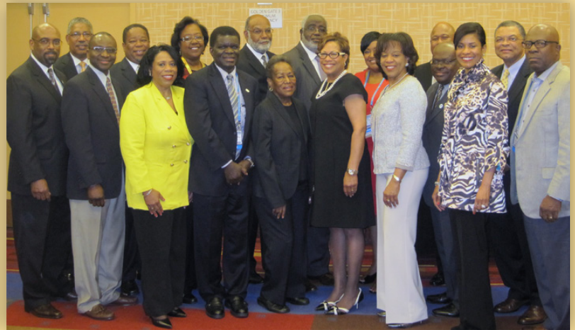
Approximately 50 members attended the breakfast and dinner events.