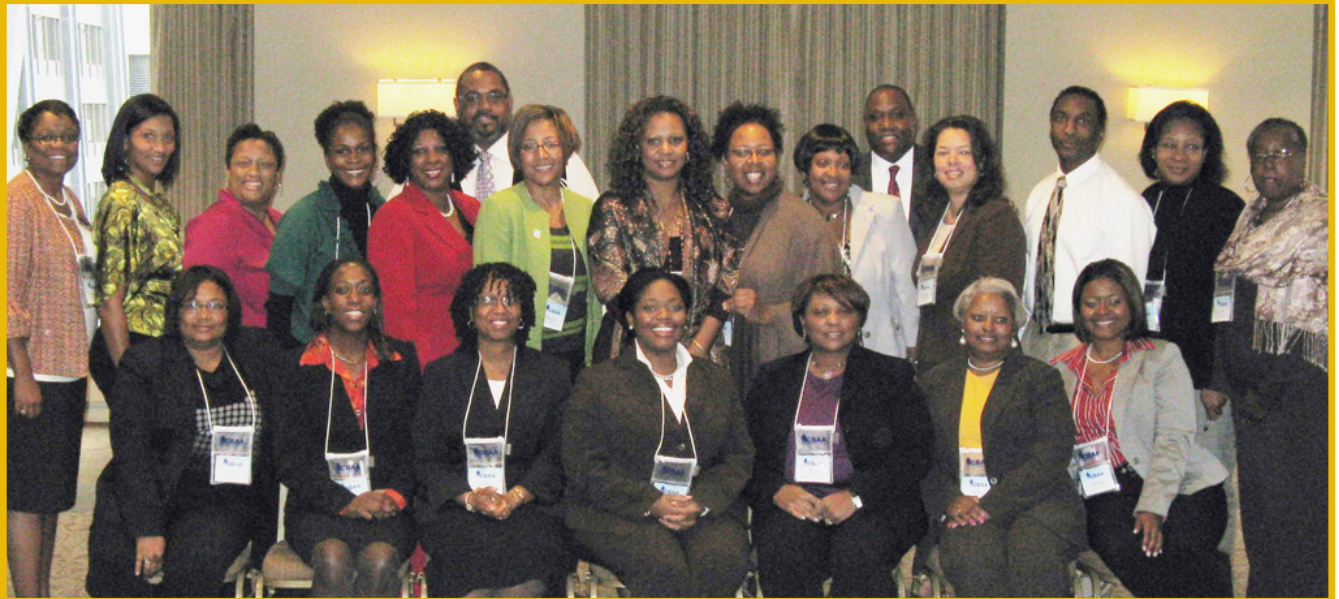
2009 Mid-level Managers Institute scholars.